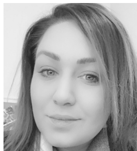
Chelsea Buff GCC Spokane